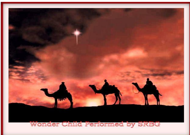
Wonder Child Performed by SRBG

For, this day is born to you a Saviour, who is Christ the Lord, in the city of David.