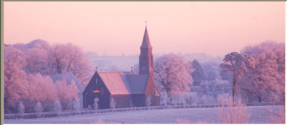
Christmas Morning Terryglass

I have always thought of Christmas as a good time; a kind, forgiving, generous, pleasant time; a time when men and women seem to open their hearts freely, and so I say, God bless Christmas!